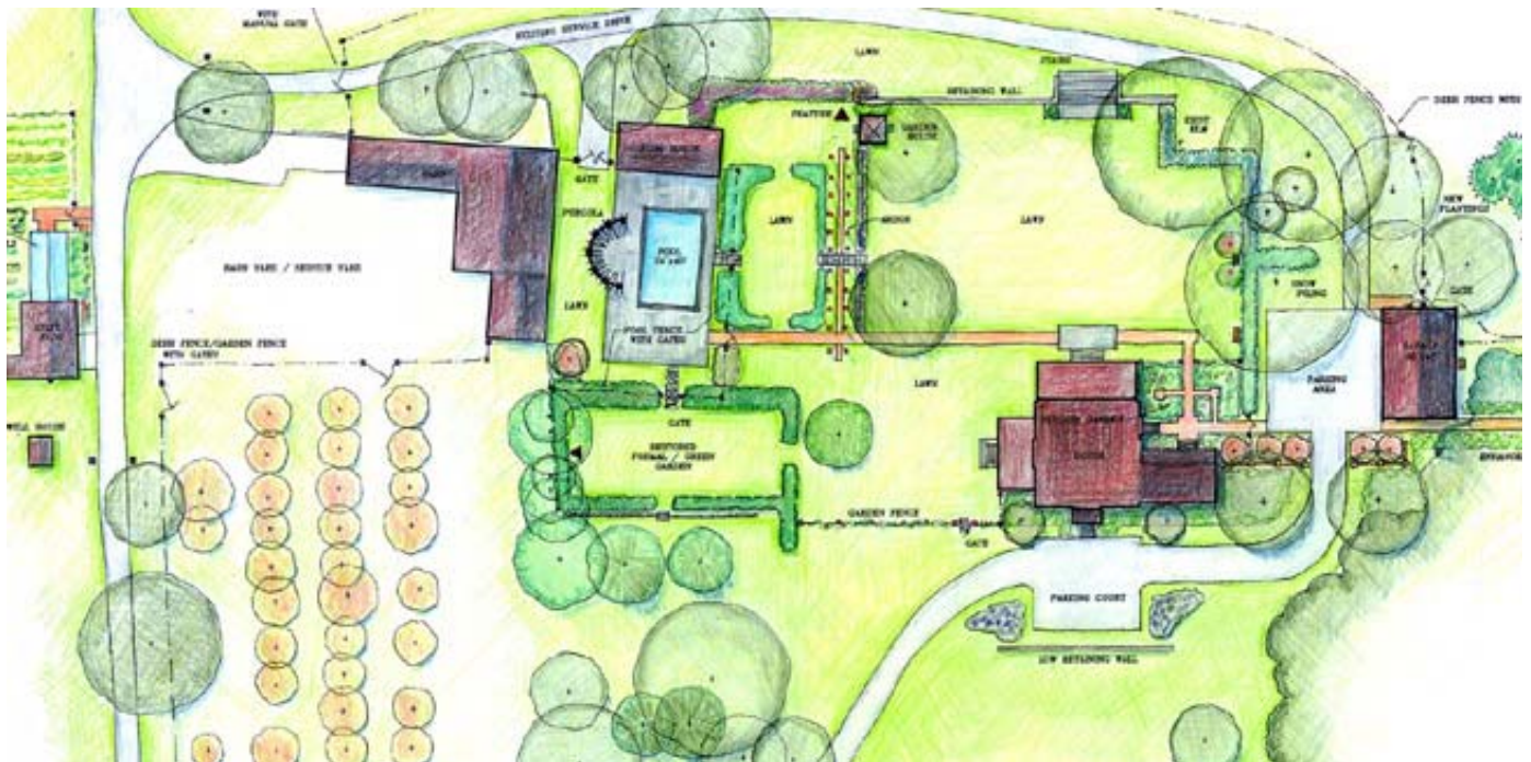
Schematic Landscape Master Plan

EDC, with Anne Wellington, was hired to prepare a Schematic Landscape Master Plan for 12 acres immediate around the main house and barn complex. After carefully assessing the landscape to develop an understanding of the site's existing conditions and historical components, we prepared 3 Schematic Design Alternatives that illustrated the client's program in different and meaningful ways. Each plan was presented and then select features from each were chosen for inclusion into the Final Schematic Landscape Master Plan. The program for this master plan included improving the arrival sequence and parking for owner and guests, a new garage, relocation of existing swimming pool, establish a kitchen garden near the back/kitchen door, identification of inappropriate plantings, new plantings, apple orchard in-fill, new tennis court, highlight and enhance western views, and a fenced-in yard for two active dogs.