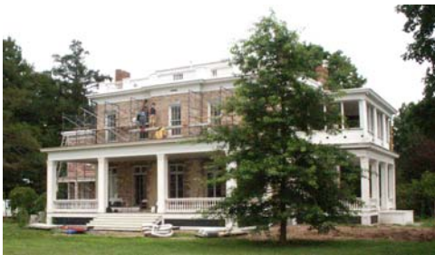
Western and southern facades under restoration (EDC, 2009)