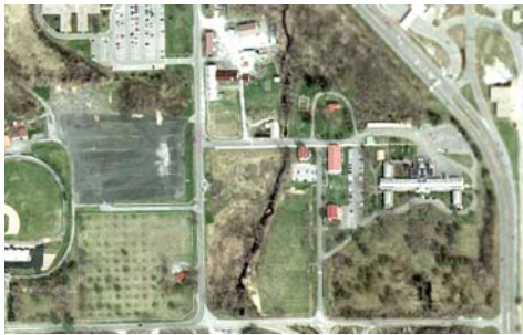
Aerial photo of the Church Family Site

The Watervliet Shaker Site is America's first Shaker settlement and the resting-place of its founder, Ann Lee. Phase II continued the efforts of Phase I with the preparation of a Site Master Plan that puts into motion a clear outline of recommendations to turn this site into a thriving mixed-use facility with commercial, recreational, and educational opportunities. Phase II is a road map for the Shaker Heritage Society (SHS) to create a historic site that is economically viable, educational, interpretive, and a destination that also conserves and improves the site's heritage.