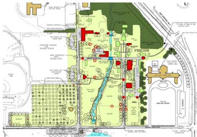
Comprehensive Site Master Plan

This project was recognized with a 2009 Merit Award from the Connecticut Chapter of the American Society of Landscape Architects.