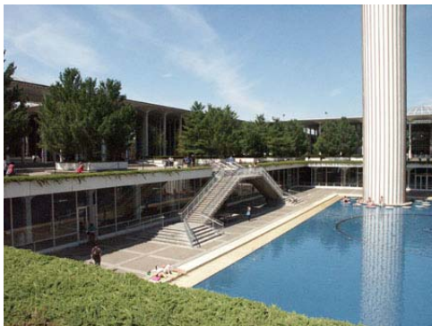
Images around campus, Spring 2008