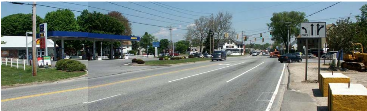
Existing condition photograph of U.S. Route 1 with up to 6 lanes of traffic and no sidewalk and few street trees.