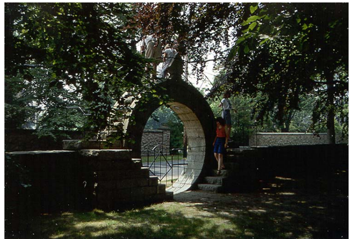
Chinese Moon Gate - 1992