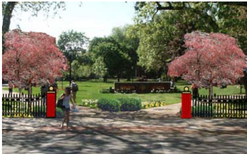
Photographic rendering with proposed fence and plantings