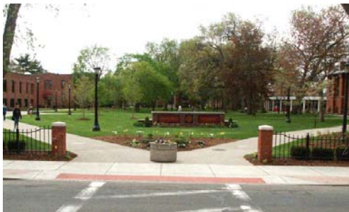
Fence is complete with Phase I plantings installed