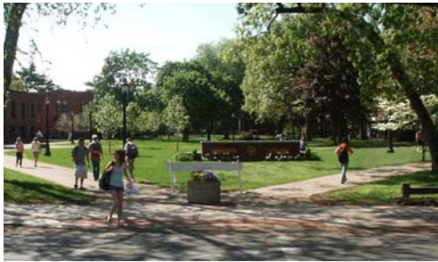
Existing conditions photograph

Date: 2010 Size ±1,200 LF Context: Centrally located in downtown Westerly, Rhode Island Construction Date: 2010