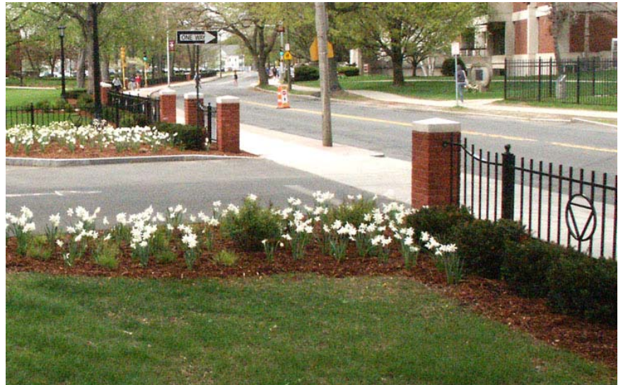
Completed ornamental iron fence with brick end-posts along Alden Street

Springfield College hired EDC with Anne Wellington to develop a plan to improve the visual character of Alden Street with a new ornamental iron fence, hedge and visually interesting plantings, while controlling points of pedestrian and vehicular access onto the campus. A series of schematic designs for the iron fence adorned with brick end-posts at the drives and walks were developed to illustrate several alternatives. Existing condition photographs were overlaid electronically with the proposed design alternatives to visually illustrate how each design would look. The final design was detailed for construction and included the ornamental iron fence adorned with the college's logo and brick end-posts, a low yew hedge, and multi-seasonal flowering shrubs, perennials, and spring-flowering bulbs for embellishment. The yew hedge will be maintained below the height of the 3' tall fence. Approximately 1,350 LF fence and plantings were installed, resulting in a significant visual improvement along Alden Street.